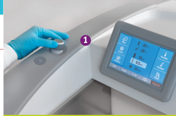
Joystick control and color LCD touch screen