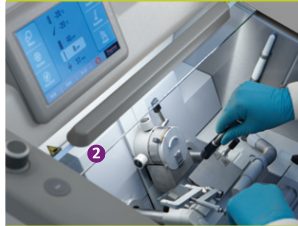
Rapid Response Temperature Control maintains sectioning surface temperature during periods of high use