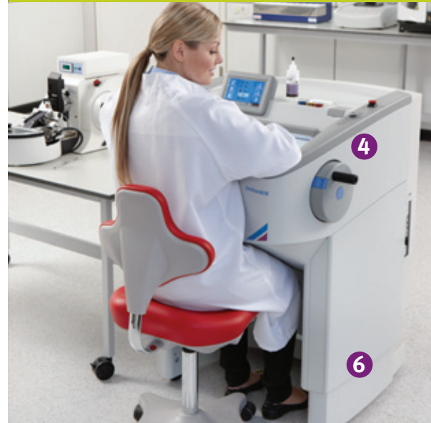
Electronic height adjustment allows up to 12 inches of vertical adjustment